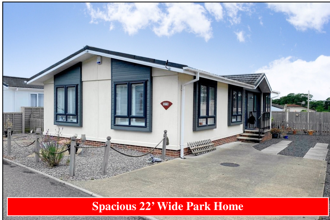
Spacious 22' Wide Park Home

121 The Crescent, Oaktree Park, St Leonards, Ringwood. BH24 2RP